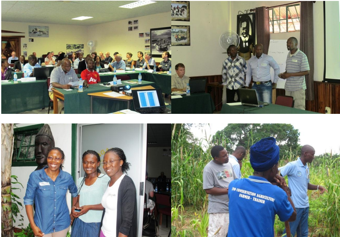
Impressions from the TFO symposium and field trip.